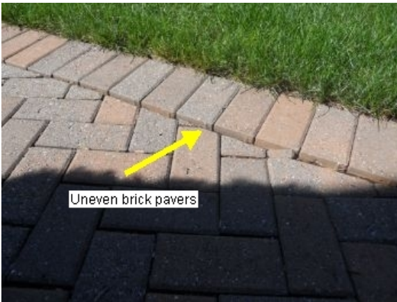
Uneven brick pavers