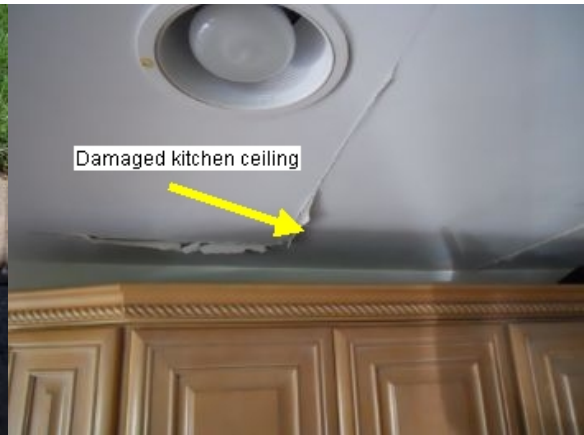
Damaged kitchen ceiling