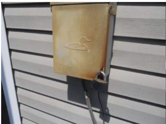
Locked disconnect switch