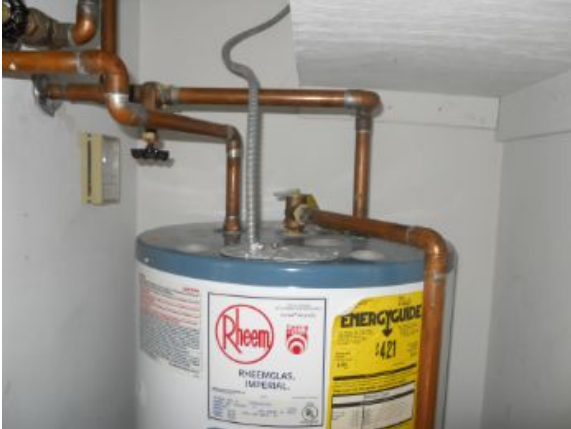
Unbonded water heater