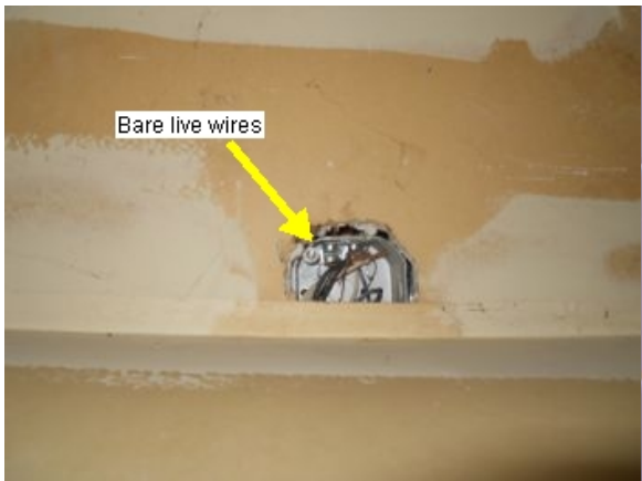
Bare live wires